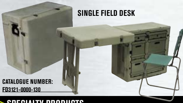
SINGLE FIELD DESK